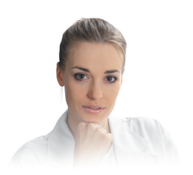
Quality Assurance Manager: With a fully compliant, portable TOC analyzer, I can quickly validate water quality at every point-of-use without having to worry about inconsistent sampling results.