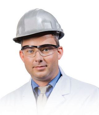
Process Engineer: If anything happens in the water system, performing water system diagnostics with multi-point analysis is fast and easy. And with the real-time measurement, I get my results immediately.