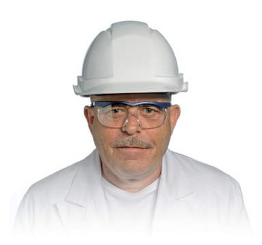
Service Engineer: With the 450TOC, I can complete component performance verification right there, on the spot, without waiting for lab results.