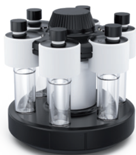
IKA Carousel complete Ident. No.0040005427