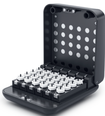
IKA e-Hive Ident. No.0040004945

ElectraSyn 2.0 Package Ident. No. 0020008980