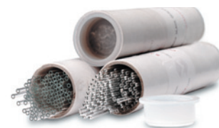
Melting point tubes