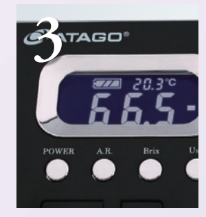
Measurement is displayed.