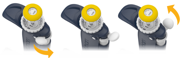
Adjustable Tip Ejector

Four PIPETMAN L multichannel models (product description ending with VR), covering a volume range from 20 \mu\text{L} to 300 \mu\text{L} , are equipped with V-rings at the bottom of the tip holders for a proper fit with most tip brands.