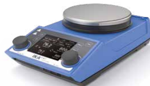
RET® control-visc Ident-No.: 0005020000

H 104 protective cover, IKAFLON 30 and 40 magnetic bars, PT 100.70 temperature sensor, USB cable