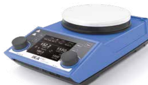
RET® control-visc white Ident-No.: 0005030000