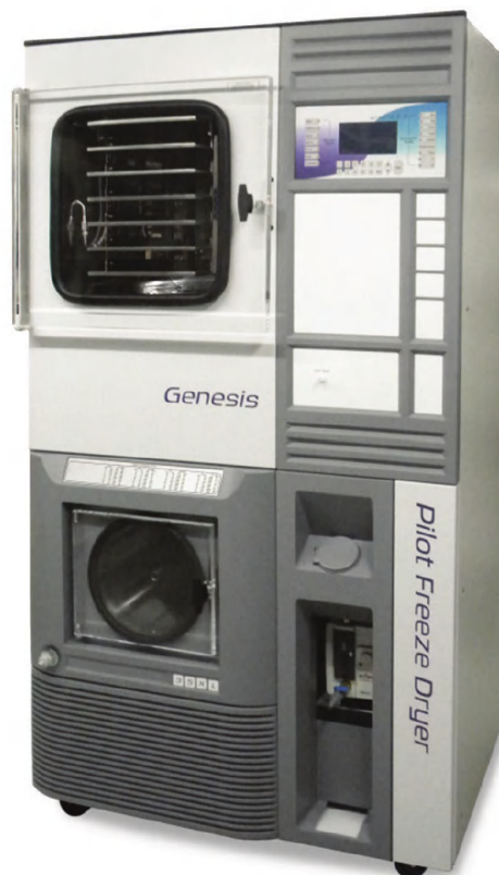
Standard configuration shown.

Note: Other electrical configurations available.