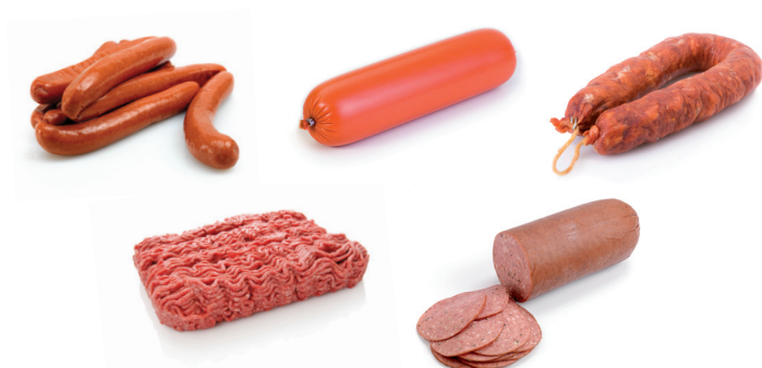
MeatScan™ measures fat in raw meat and meat products.