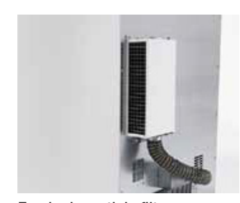
Fresh air particle filter