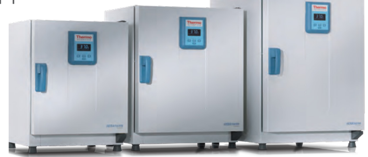
Heratherm General Protocol Ovens, 60 L, 100 L, 180 L models