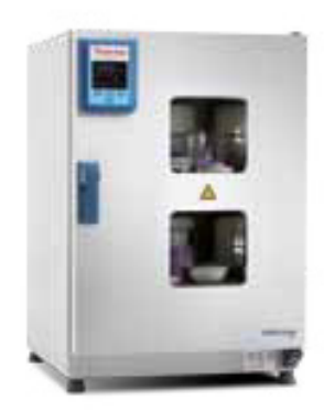
viewing windows in 180L Unit