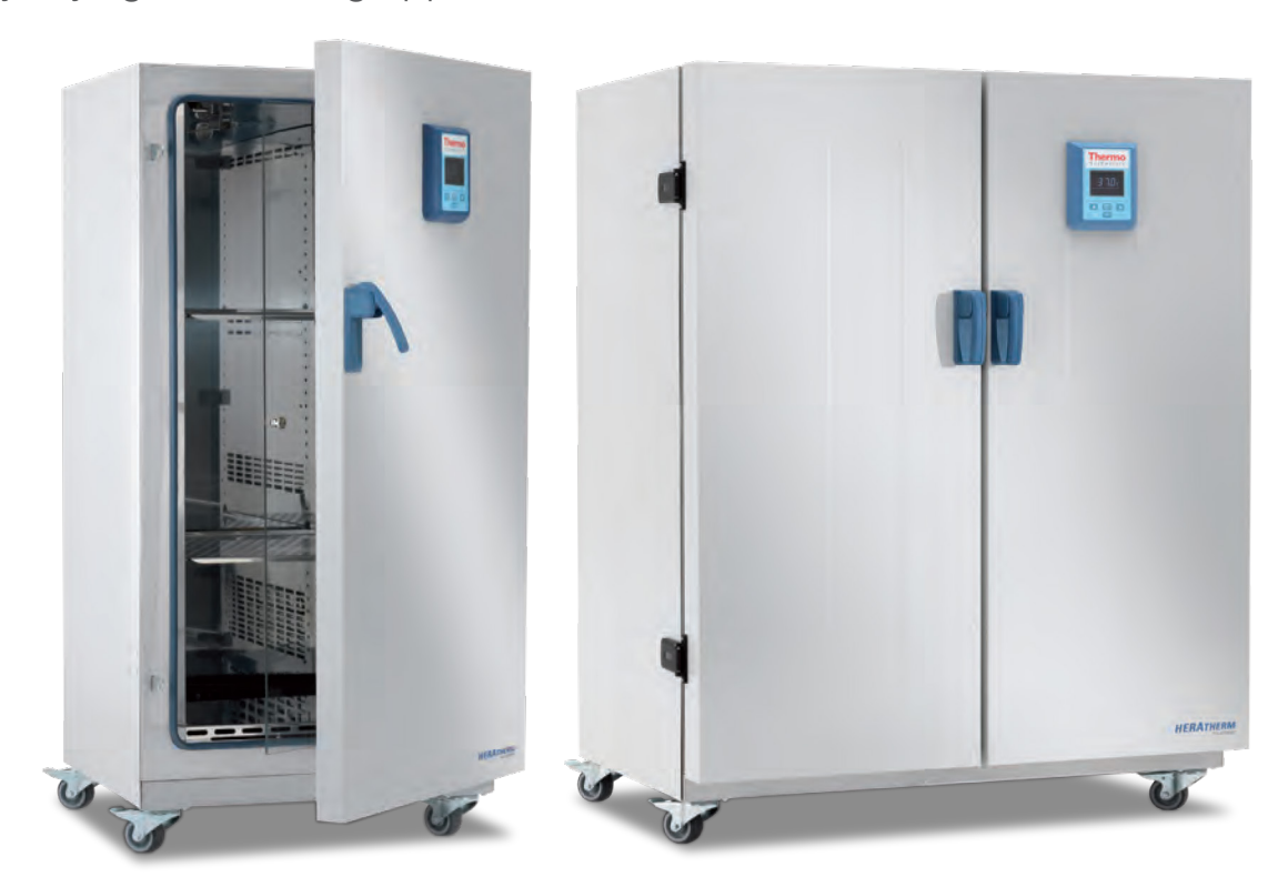
Heratherm large capacity ovens are available as 400 L and 750 L units

Heratherm large capacity ovens have been designed with your need for larger samples or high sample volume in mind. The General Protocol ovens provide high capacity for day-to-day drying and heating applications.