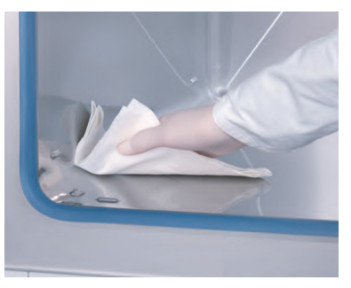
Smooth inner chamber with easy to clean rounded corners