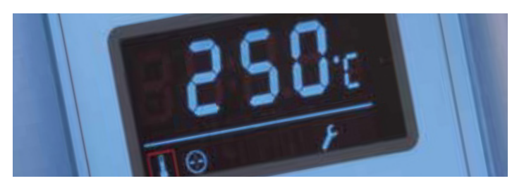
Easy-to-view, vacuum fluorescent display with simple-to-use touch button operation