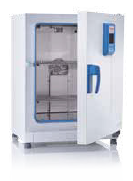
All Heratherm Advanced Protocol Security ovens are available in coated or stainless steel exterior. (model 100 L shown)