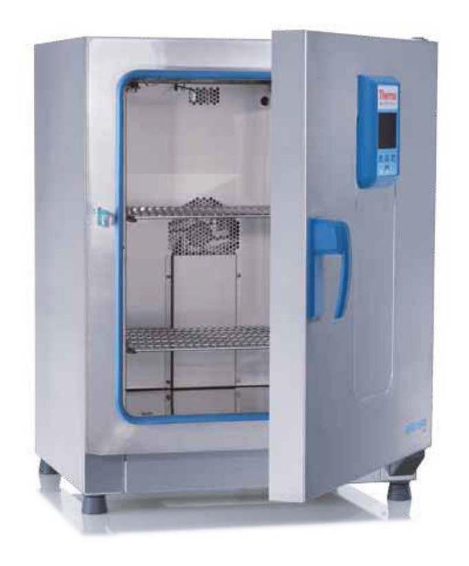
100 L model shown