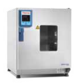
Viewing window in 100L unit