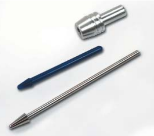
EPPI-pestle made of polypropylen and stainless steel with quick-grip clamp