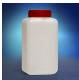
Square bottle 1L HDPE