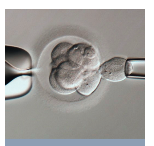
Biopsy techniques on animal embryos in research applications