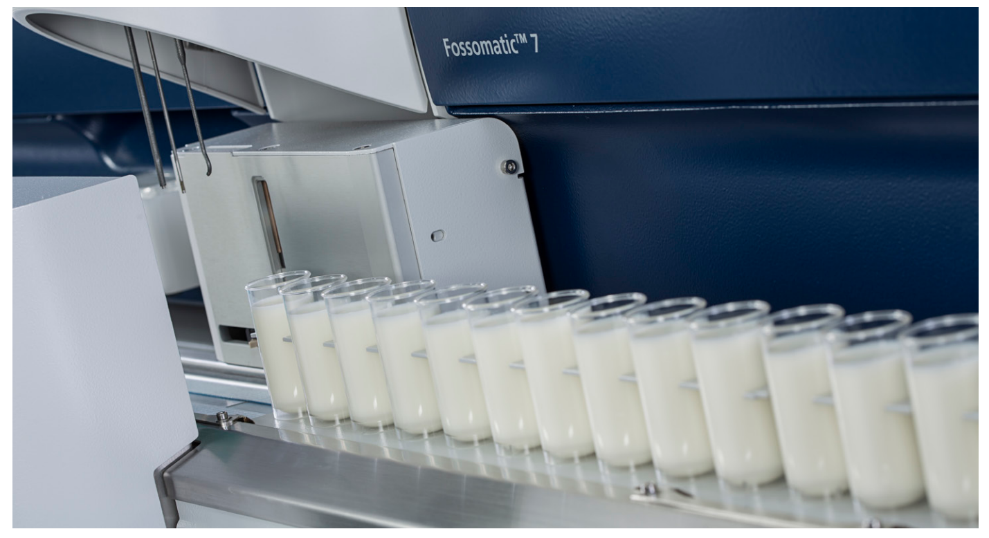
Caption: Up to 600 samples per hour handled with minimal cleaning and maintenance work