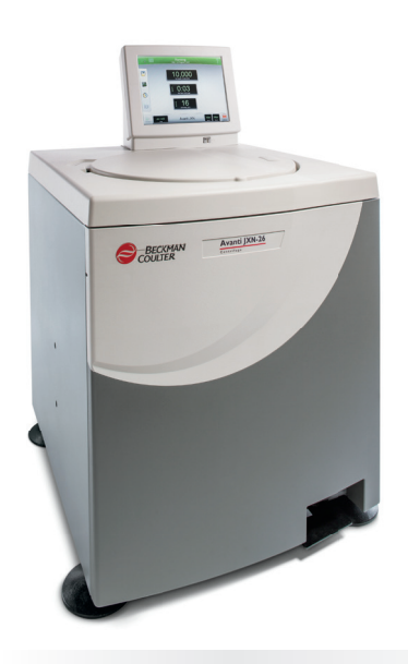
Avanti JXN 26