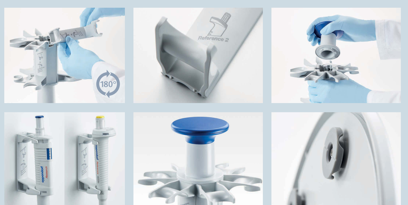
Downwards compatible holders for Eppendorf Research and Reference manual pipettes.

Fast interchangeable pipette holders and charger shells, no tool required.