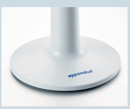
A small footprint with a diameter of 18.5 cm makes stands and carousels ideal when space is at a premium.