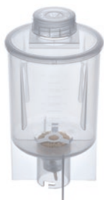
DIS-300-S-M.10 Dissolver tube Volume: up to 300 ml Application: Crushing and dissolution of tablets and dragées. This tube is equipped with a dissolver blade and opens up new application fields. It was especially designed for dissolving samples in different solvents. Ident. No. 0020016318