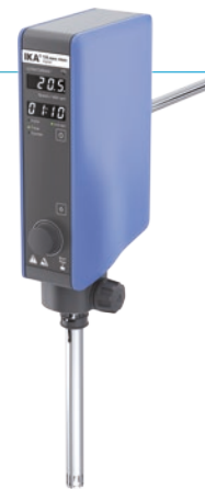
T 25 easy clean digital High-performance disperser Ident. No. 0025002560