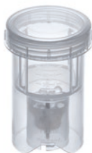
BMT-50-G Tube for grinding with glass balls (10x) Volume: 15 – 50 ml Application: Dry milling of dry and brittle samples (e.g. kaolin, gypsum, coloured pigments, tablets), cell maceration, processing of materials mixed with fluids. Ident. No. 0003699800